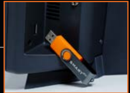
DATABASE, MANUAL AND SAFETY KEY IN ONE