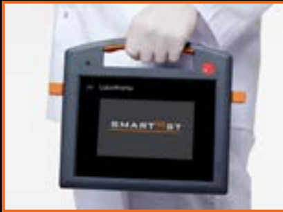
FUNCTIONALITY AND COMFORT