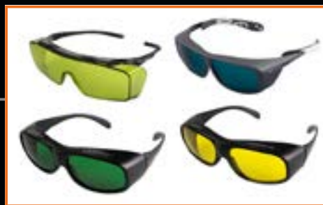
SAFE FOR DOCTOR AND PATIENT