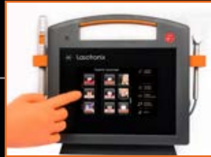
EVERYTHING AT A GLANCE