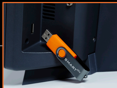
DATABASE, MANUAL AND SAFETY KEY IN ONE