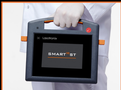
FUNCTIONALITY AND COMFORT