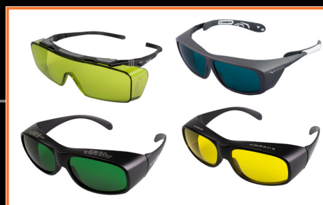
SAFE FOR DOCTOR AND PATIENT