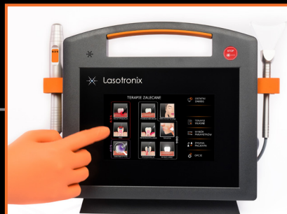
EVERYTHING AT A GLANCE